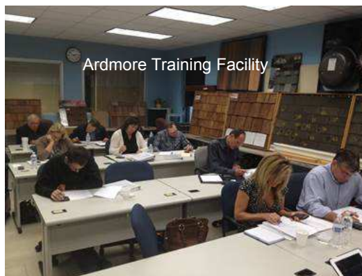
Ardmore Training Facility

**To Register please visit www.aiacenters.com