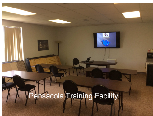
Pensacola Training Facility