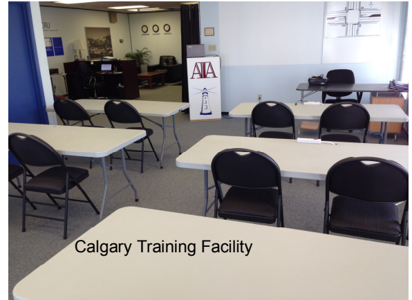
Calgary Training Facility

Plus, we are offering a slew of other shorter classes and getting them CE accredited across Canada and the US.