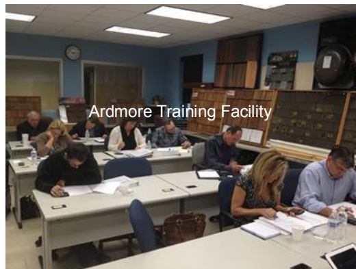
Ardmore Training Facility

**To Register please visit www.aiacenters.com