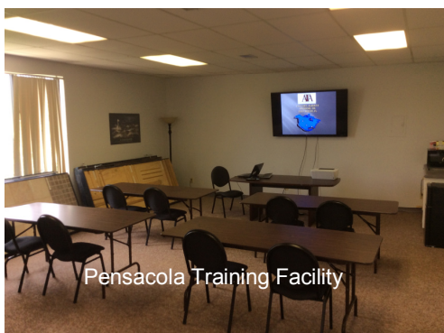
Pensacola Training Facility